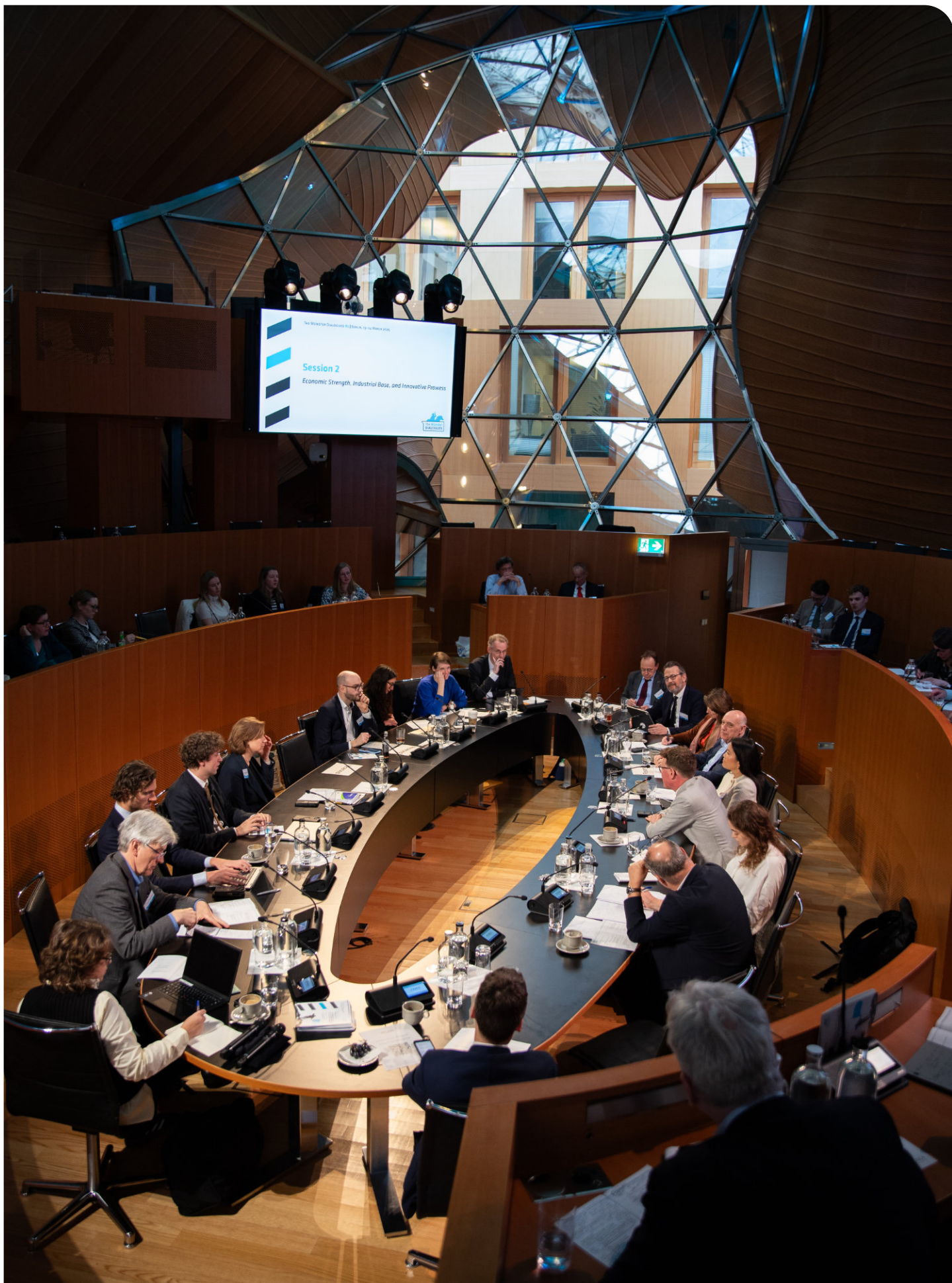
› A snapshot from Session 2 of The Münster Dialogues #1 2025