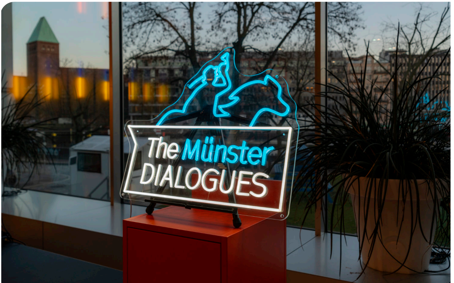
› The Münster Dialogues logo at the Dutch Embassy in Berlin