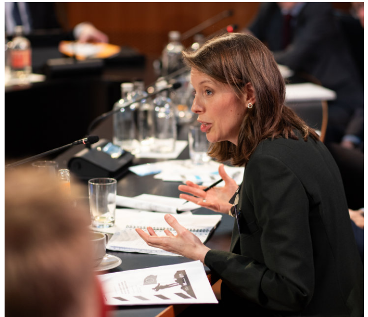
› Impressions from the three sessions of The Münster Dialogues #1 2025

The concluding plenary brought together these strands. It was opened by students of the ZNS Centre for Dutch Studies, who introduced questions developed during the day. Eckart Conze compared the current situation with earlier shifts in the global power system. Inspired by his call to fundamentally rethink Europe's security needs, the discussion returned to the central question of the conference: what impact can German-Dutch cooperation have on Europe's path towards greater strategic autonomy?