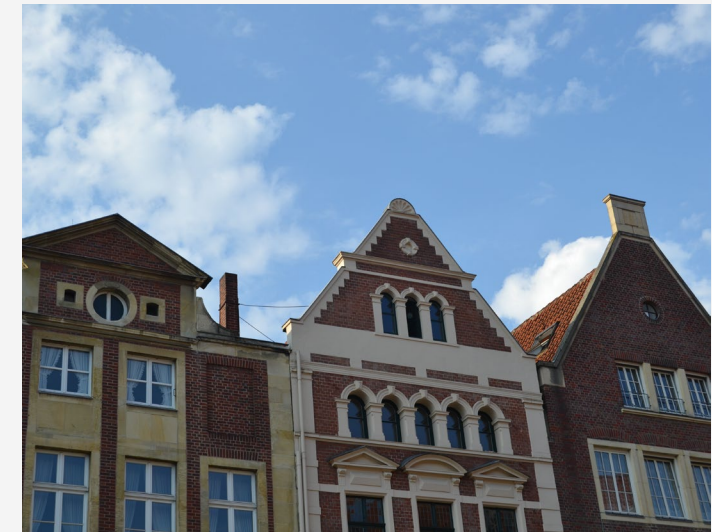
Uni MS - Sonja Zeggel