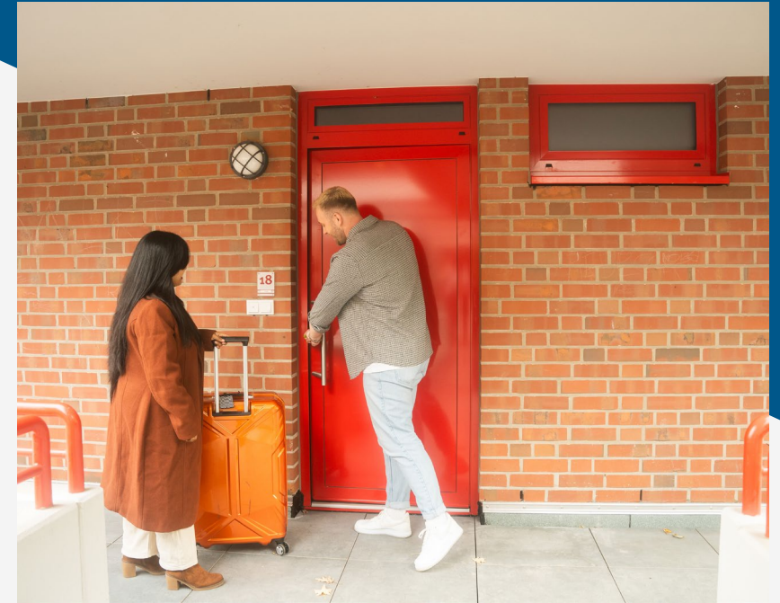
Uni MS

5. Registration and Documents : Register at the local registration office (Bürgeramt) within two weeks of moving in. Required documents include ID card/passport, landlord's certificate of residence (Wohnungsgeberbestätigung), and, if necessary, a registration form.