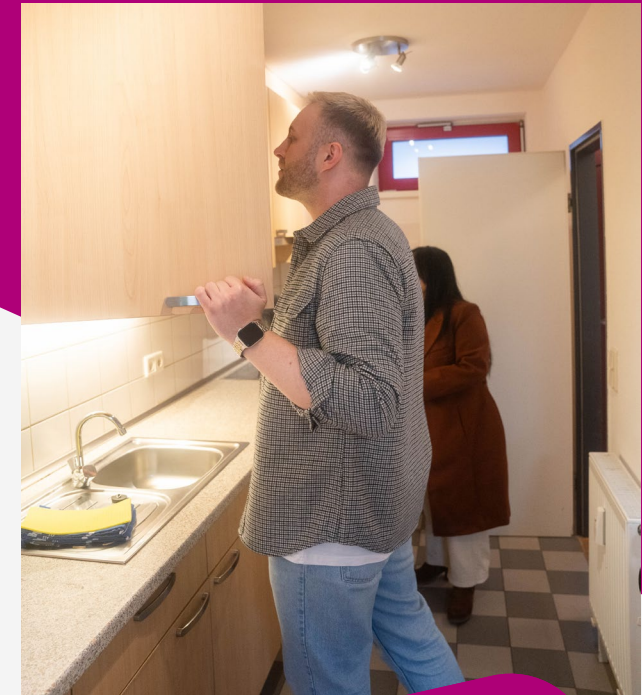
Uni MS

Searching for apartments on various websites is free. Some properties may be offered by agents who receive a commission for successful placement.