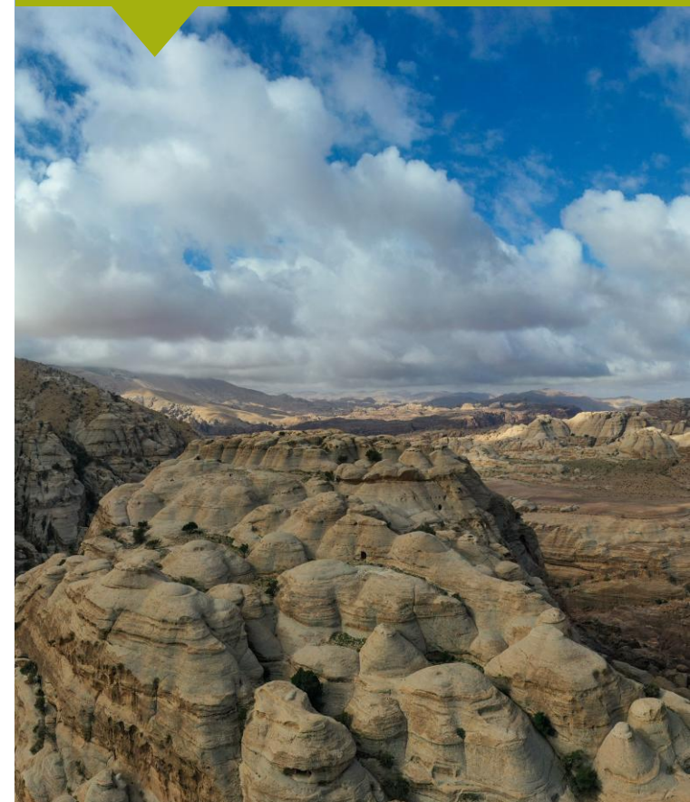
Image: Mountain-top Site Jabaḷ_Qsayr