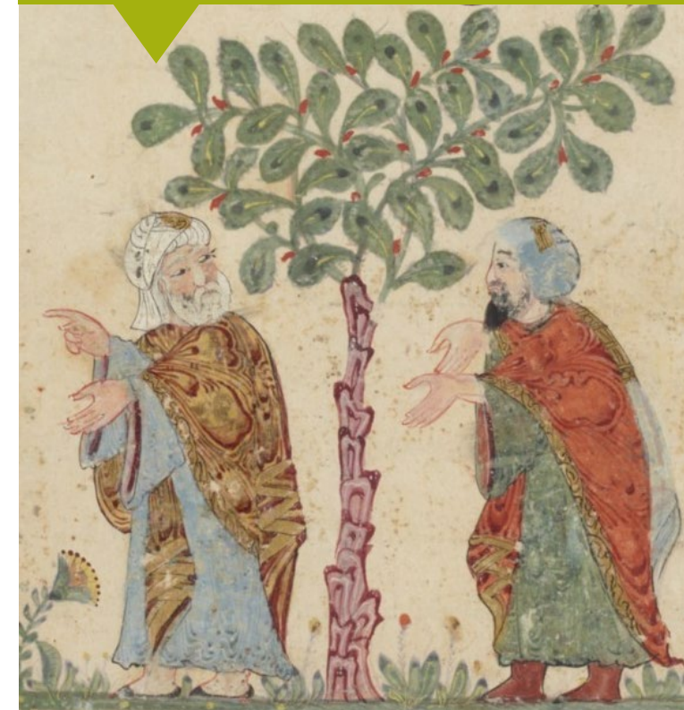
Image rights: Bibliothèque nationale de France, Ms. Arabe 5847 (front), E. Gokul (back)