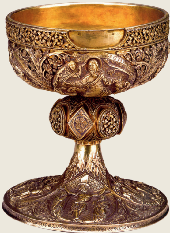
Master Sifridus, Mass chalice (so-called Sifridus chalice), around 1240 Domkirchengemeinde, Borgå-Porvoo/Finnland

P recious crosses, magnificent chalices and reliquary caskets, elaborately designed book covers and cloak clasps: The exhibition presents more than 300 works of art from the 10th to 16th century, including a large number of international items on loan. The silver-gilt statuettes produced by Westphalian goldsmiths are unique. As well as the ecclesiastical treasures, there are also numerous items for secular use such as municipal silver, but also filigree rings or brooches for the goldsmiths' town-dwelling customers.