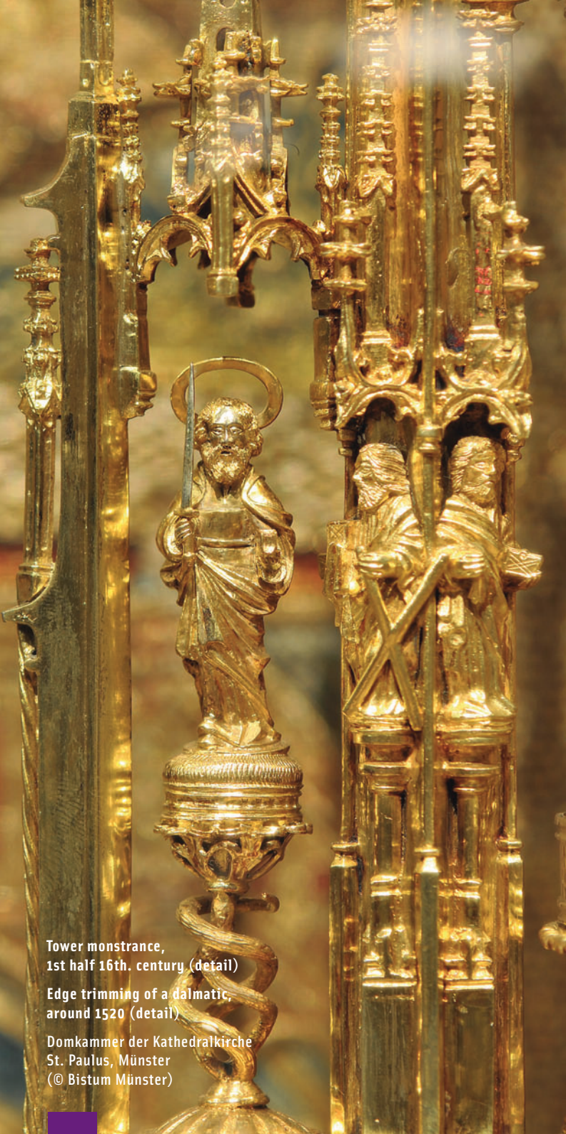
Tower monstrance, 1st half 16th. century (detail)