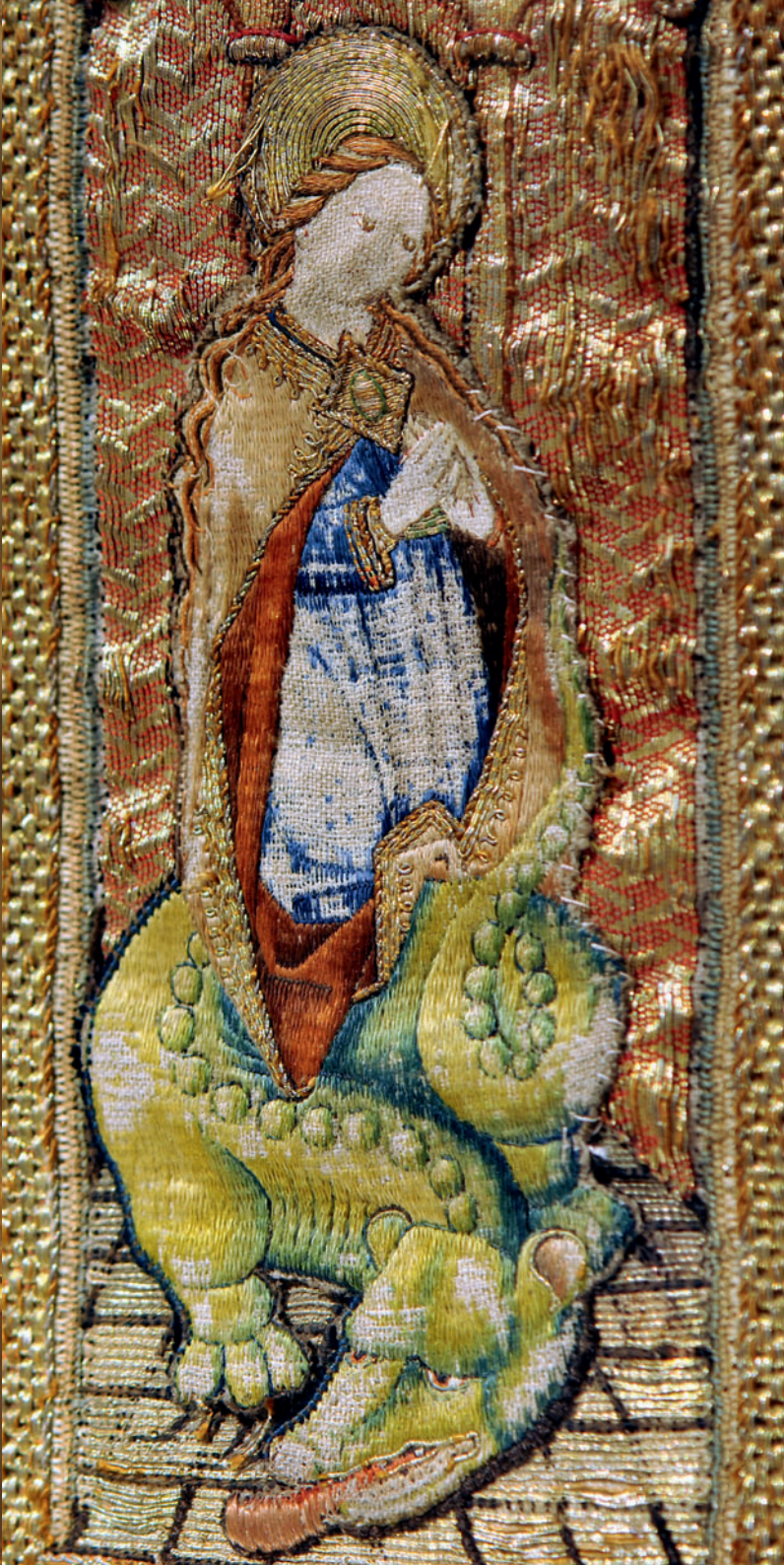
Domkammer der Kathedralkirche St. Paulus, Münster