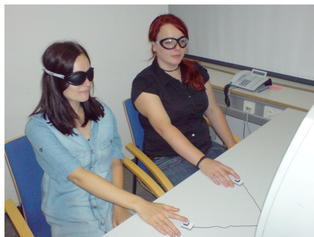
FIGURE 3 | Goggles used in the blindfolded (see left participant) and seeing conditions (see right participant).

The error rate was again very low (1.2%). Median RTs for correct responses were entered into a two-way mixed ANOVA, with the independent variable Congruency (congruent, incongruent)