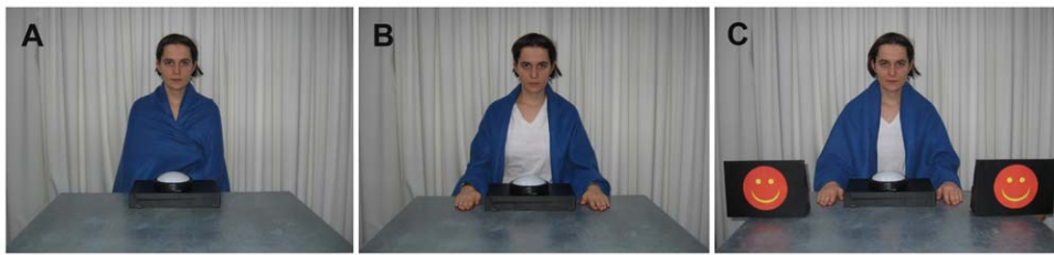
Figure 1. Experimental setup. The model before performing the head touch action in the hands-occupied and hands-occupied familiarization condition (A), the hands-free condition (B), and the hands-free distraction condition (C). doi:10.1371/journal.pone.0032563.g001

hands-occupied condition ( hands-occupied familiarization condition ), we aimed to reduce perceptual distraction from the strange and unexpected appearance of the model by familiarizing the infants with the sight of this appearance during the 5-minute warm-up phase which in all conditions preceded the imitation task. Second, in a new version of the hands-free condition ( hands-free distraction condition ), we aimed to enhance perceptual distraction by placing red smileys on the table.