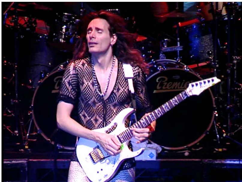
Pic. 1: Steve Vai Live At The Astoria London 2001 – © Steve Vai 2003

suggest you use these body language techniques all the time. But in the never-ending struggle to be original, you must search the depths of your soul, and these techniques may help.” 19