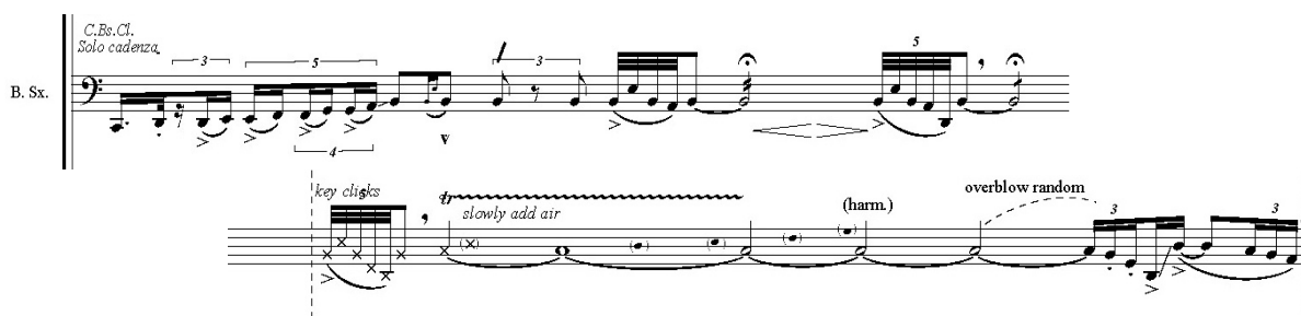
Pic. 3: Frangelica II (Metropole Orkest-Version 2005), Counterbassclarinet bar 147-148 – © Steve Vai 2010