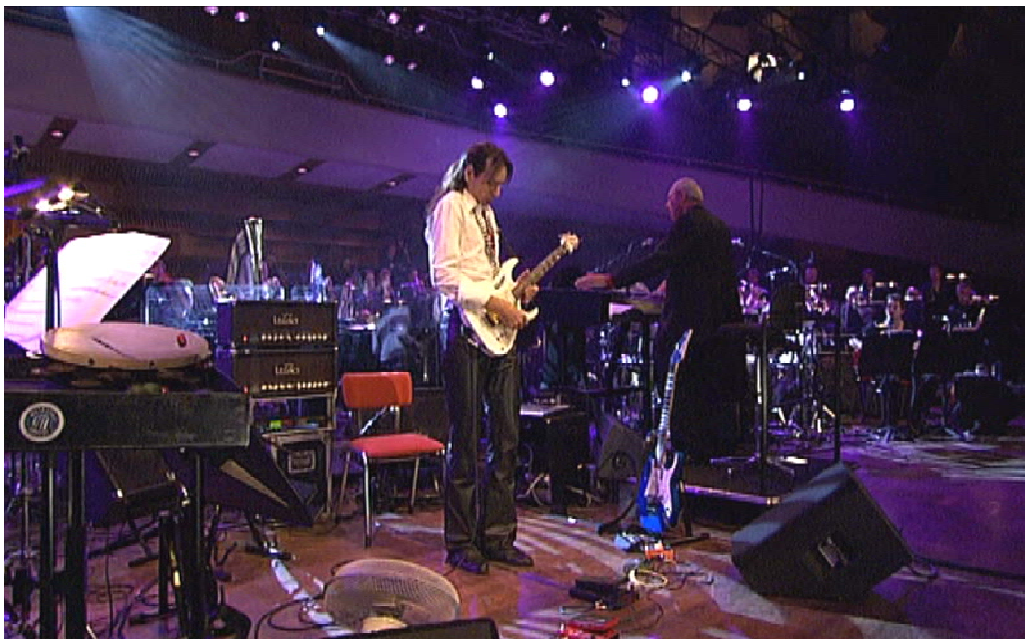
Pic. 2: Steve Vai Live with the Holland Metropol Orkest 2005