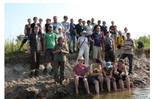
Fig. 2 Participants of the Summer School 2009 on a field trip to learn about floodplain restoration at river Lippe near Soest.

Among the 2009 and 2007 participants, there was a very high interest in courses on the prediction and analysis of outcomes of restoration activities as well as on laboratory practicals , particularly on experimental design and on the analysis of maps to produce restoration plans.