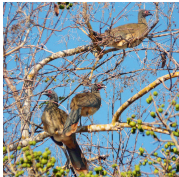
Fig. 2–3. The Citreoline Trogon Trogon citreolus sumichrasti and the West-Mexican Chachalaca Ortalis poliocephala poliocephala are endemic to West-Mexico mainly restricted to the Pacific slope. Both are rather difficult to observe in the tropical deciduous forests of mainland Chamela reserve but are unmistakably identified and localised by their intensive calls.