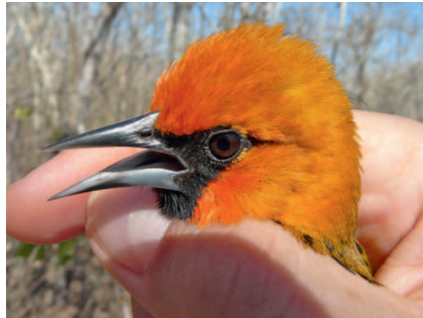
Fig. 4–5. The Cinnamon Hummingbird Amazilia rutila rutila and the Streak-backed Oriole Icterus pustulatus microstictus were caught in the mainland Chamela reserve during the dry seasons in March 2009 and 2010. They also are distributed along the Pacific side of Mexico, their ranges reach further south to the evergreen tropical rainforests in Central America.

gradient is found: from mainland Chamela via the coastal Marias to the oceanic Revillagigedos the degree of relatedness of bird taxa overall decreases.