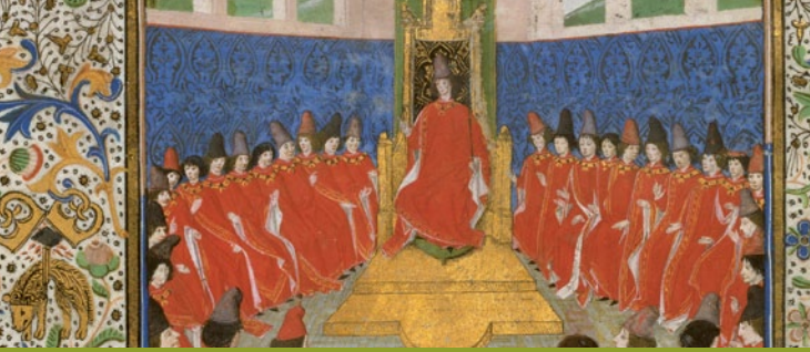
Versammlung des Ordens vom Goldenen Vlies, 1473