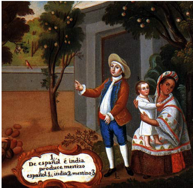
Image: Unknown author, 1780, Colección de Malu y Alejandra Escandón, via Wikimedia Commons, public domain.

The project aims at tracing the origin, dissemination, translation and adaptation of the categorization in the early modern Americas. It studies practices of mestiz@s and their families and processes of belonging and migration in a transimperial approach.