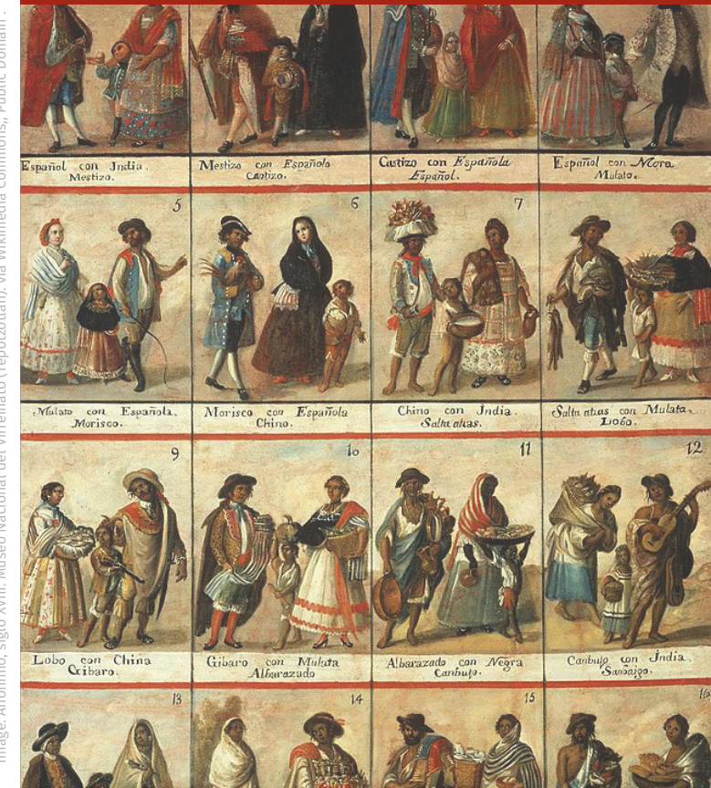
Image: Anónimo, siglo XVIII. Museo Nacional del Virreinato (Tepotzotlán), via Wikimedia Commons, Public Domain.