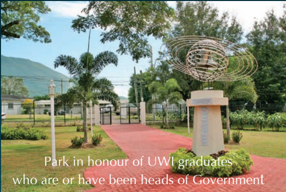
Park in honour of UWI graduates who are or have been heads of Government

“All praise this initiative that aims to free poetry from its tag as a ‘boring subject’ and relocate it in the minds of teachers and students as a lifelong gift to be savoured and treasured”