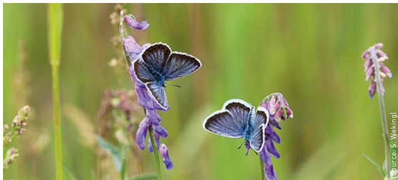
Blue Argus butterfly.

of the increasing aridity of the steppe regions in Kazakhstan and Southern Siberia, cereal cultivation will shift further north into the forest steppe zone and the pre-taiga«, says Dr Johannes Kamp, a landscape ecologist from Münster University, who is coordinating the project. Such a shift carries risks because the wetlands, forests, and steppes of Western Siberia are some of the world's most important carbon sinks. The wetlands alone cover 600,000 km 2 and store a quarter of all carbon stored in terrestrial ecosystems. »If these carbon stocks were released, they would contribute massively to global warming«, Kamp explains.