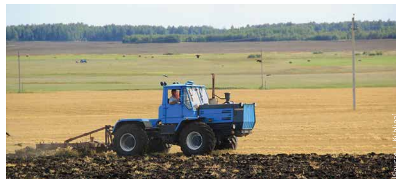
Ploughing in August.