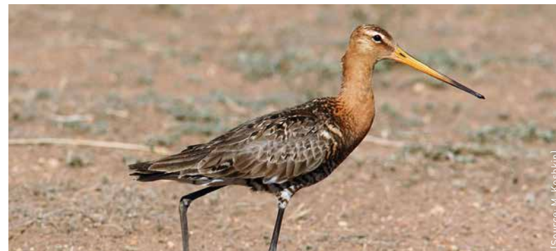
Black-tailed Godwit, still widespread in wet meadows.

For Hölzel's research teams, however, eight sub-projects are not just about investigating the consequences of land-use change for the climate. The researchers also want to find out how this change affects biodiversity, soil fertility, and the water table. To allow them to model these consequences, the researchers are diligently gathering basic data which were not available previously. Zoologists and botanists for example are counting how many butterflies, grasshoppers, birds, and plants occur in the three study areas, which together total an area of 1,200 km 2 . »This was a blank spot in biodiversity research until now«, says Hölzel. The scientists have