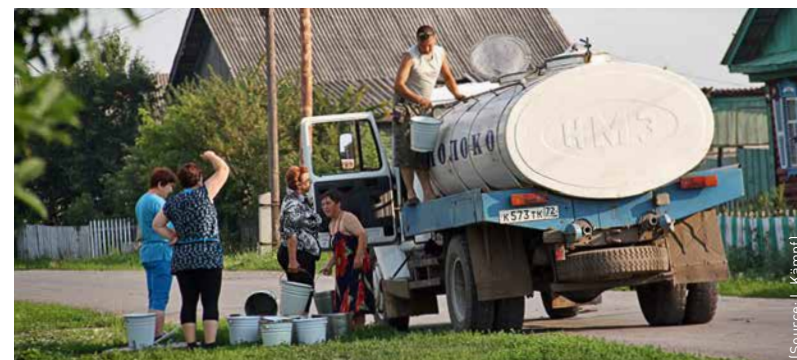
Daily milk collection – subsistence farming in remote villages.

from the Osnabrück University of Applied Sciences is working with local agricultural businesses in a further SASCHA sub-project to investigate how different farming methods affect soil water content and fertility. »On many farms the land is still ploughed, while in other parts of the study area the soil is not tilled but only scarified«, she says. Neither method is ideal, as erosion and other problems can still occur. The agricultural scientist therefore wants to experiment by sowing seed directly onto the soil. With this method the seed is