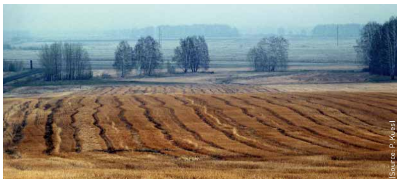
Stubble fields before sowing.

allowed the farmers to profiteer here for many years«, says Hölzel. But meanwhile the soils have been degraded in many areas by their use for intensive monoculture. One of the SASCHA sub-projects is therefore aimed at investigating in particular how to stop the depletion of the humus layer in order to restore soil fertility.