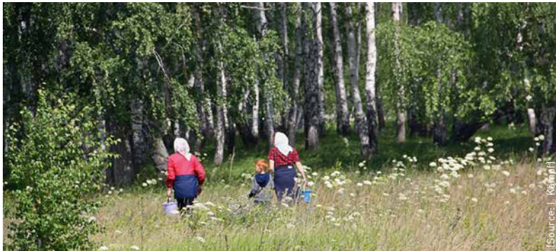
Wood strawberries are gathered by the bucket in the forest steppe, as here in Ishim.

cycle in rotation with rapeseed, maize, and wheat. »Soya is a legume, so it fixes nitrogen. This actually makes it very attractive for farming«, he says. In the experiments Trautz examines how well the soya plants withstand competition from weeds and how they can be protected against sudden drops in temperature in the spring, particularly during the susceptible early growth stages. If the experiments go well, prospects for beginning soya cultivation are favourable, because Trautz knows he has the backing of the region's politicians.