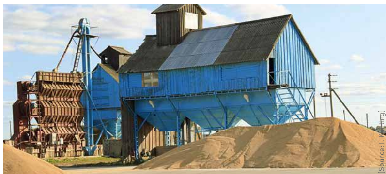
Grain drying – often the limiting factor during harvest.

plot the areas in which agricultural use of the land makes economical sense, taking account of biodiversity, water quality and quantity, and carbon storage«, says Hölzel. He believes that this model could also be successfully transferred to other continental steppe regions in China, Mongolia, and Kazakhstan.