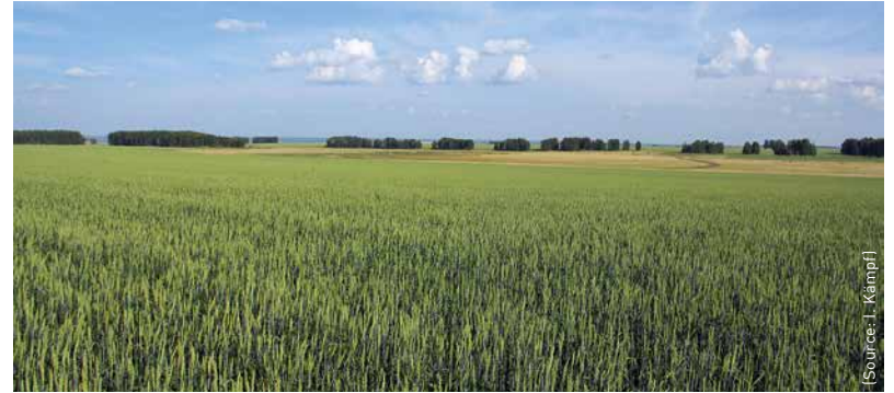
Wheat fields as far as the eye can see.

B lack-tailed Godwit, Yellow Wagtail, Corncrake – species such as these send ornithologists into raptures. In Germany these birds are seen increasingly rarely as wet meadows and pastures are drained, fertilized and converted into arable land. In the Russian province of Tyumen, deep in Western Siberia on the border with Kazakhstan, the meadow birds' habitats are still intact in many places so their numbers are significantly higher. »The birds are as common there as they were in Germany in the 1950s« reports Professor Norbert Hölzel with delight. There are good reasons for this: after the Soviet Union made tremendous efforts to plough up millions of hectares of the steppe to grow wheat in the 1950s, many grasslands were then left fallow after the political and economic collapse of the 1990s. Today rare waders thrive there. But the biodiversity is under threat: »If in the future the meadows and pastures are turned back into arable land and agricultural use intensifies, this will have negative effects on the bird fauna«, says Hölzel, who works as an ecosystems researcher at the Institute of