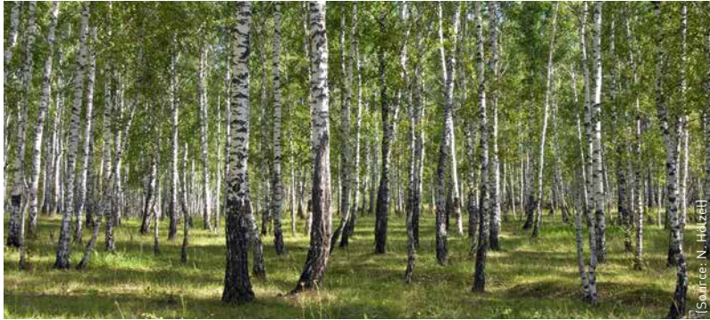
Siberian birch grove in the forest steppe (summer).