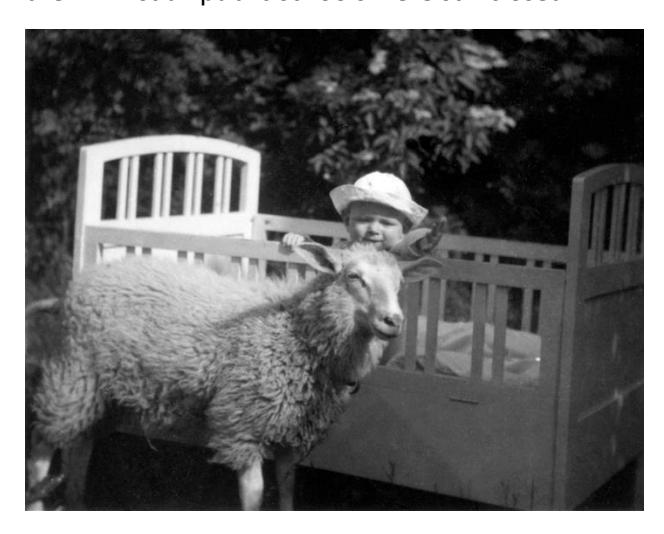
Fig. 1. RS , showing his love for nature early on, with no fears of

before being able to take up a position in chemistry again, gave private school instructions to the children whilst all public schools were still closed.