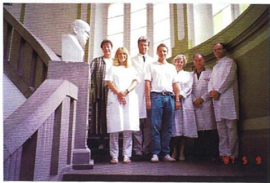
...the grim look of the founder of the Institute of Pathology (Marchand)