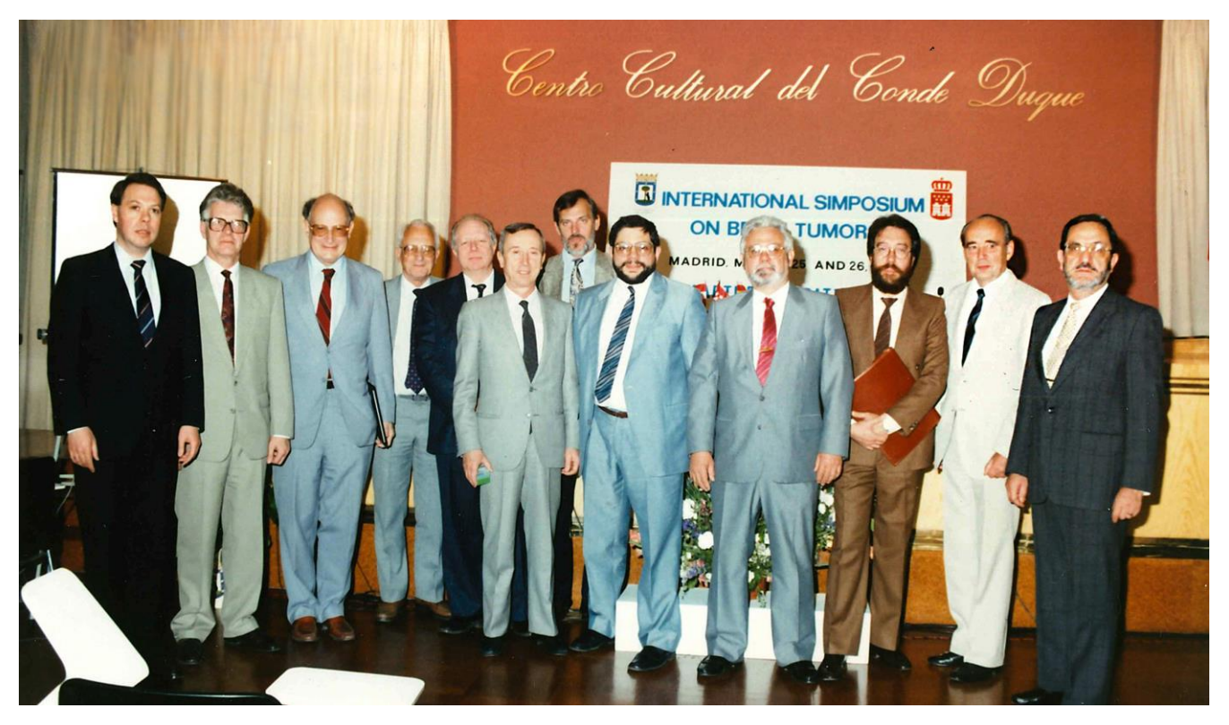
Fig. 4: Participants of the International Symposium on Brain Tumors in Madrid, 1990.

and in some cases even to spontaneous recovery of the patients (11, 22). This has been seen with neuroblastoma in the sympathetic nervous system and very rarely also with stem cell tumors in the central nervous system. In many cases, the differentiation process remains on a low level and only gets to part of the tumor tissue, hence having no effect on the course of the disease without improving the prognosis. Furthermore, together with my staff, I intended to research how these maturation processes are controlled, and to find out which therapeutic possibilities might emerge from this. This research produced first results, but had to be suspended in 1994, leaving the intended tasks unfinished. It is my hope that the next generation of researchers will take up this topic and perhaps win the Nobel Prize in medicine.