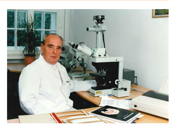
Fig. 12: Working in the department of neuropathology of the Landesklinik Brandenburg, 1995.

Shortly after the announcement of my separation from the Charité the medical director of the Landesklinik Brandenburg offered me to become director of their department of neuropathology. It