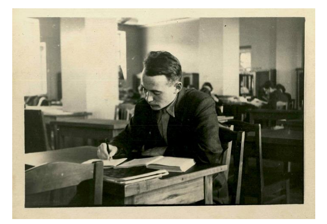
Fig. 1: In the reading hall of the dormitory in 1953.

in different special areas and could thus learn about and participate in professors' research activities. I took part in this as well, first in anatomy and later in pathology. In 1958, my studies concluded with a state exam "with distinction" ("Ausgezeichnet"), and I returned to the GDR.