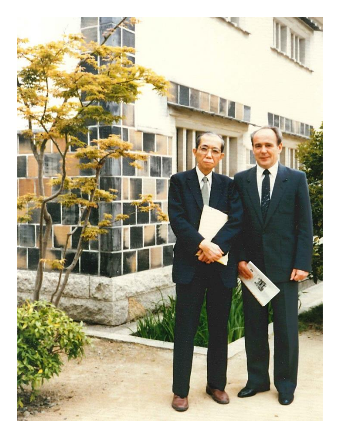
Fig. 6: With Professor Katsuo Ogawa in Okayama, 1985.

the Soviet brand Lada. The advantage of this car was that it was very sturdy, and therefore always ready to be used in the summer heat and resistant to driving on desert roads. Since this car was the only one of its type in the whole city everyoneknew who was coming along when I was going somewhere in it. Despite the lack of any traffic rules, I was never involved in an accident. The department of pathology was housed on the fourth floor of a new building for theoretical medical disciplines and had four large rooms and its own lecture hall for 150 students, but no room for conducting autopsies. The staff consisted of an assistant of Kurdish nationality who had studied veterinary medicine, an English-speaking manager and four male staffers who only spoke in Arabic. One of them was able to prepare paraffin sections and preparations with the usual aniline colorations. The other three assisted by fetching things, cleaning up and making tea. In an adjacent chamber, there was an electron microscope, which had been ordered by one of my predecessors, and it was still unused. There were no tools available for ultrathin sectioning. For the trai-