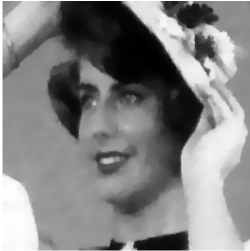
Figure 3: Same as Fig. 2 with now \sigma = 25 .

average, which is usually the case). We leave it to the reader.