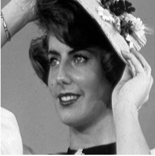
Figure 1: An image.

We thus propose the following algorithm, in order to solve (11). We assume N\sigma is between 0 and \|g - \langle g \rangle\| . We need to find a value \bar{\lambda} for which f(\bar{\lambda}) = N\sigma . We first choose an arbitrary starting value \lambda_0 > 0 , and compute v_0 = \pi_{\lambda_0 K}(g) with the algorithm described in section (3), as well as f_0 = f(\lambda_0) = \|v_0\| . Then, given \lambda_n, f_n , we let \lambda_{n+1} = (N\sigma/f_n)\lambda_n , and compute v_{n+1} = \pi_{\lambda_{n+1} K}(g) and f_{n+1} = \|v_{n+1}\| . We easily deduce from Lemma 4.1 the following theorem.