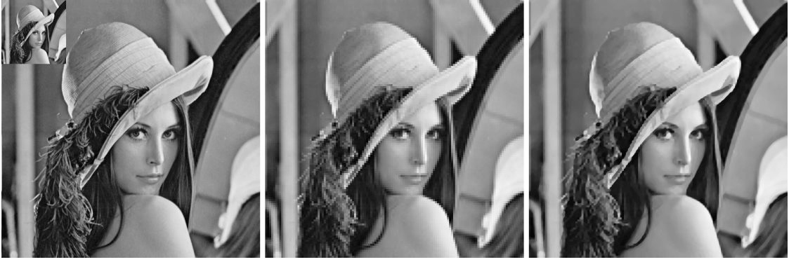
Figure 4: Left: original 512 \times 512 Lena and a 128 \times 128 reduction. Middle, the small image expanded by a factor 4. Right, the small image expanded by 4 using the algorithm of Section 5.

with J defined by (2). We define the operator T_h by letting T_h E = \{w > 0\} , with w the solution of (13).