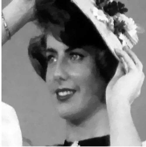
Figure 2: The image of Fig. 1 and its reconstruction ( \sigma = 12 ).