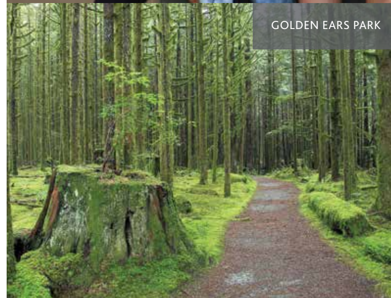
GOLDEN EARS PARK