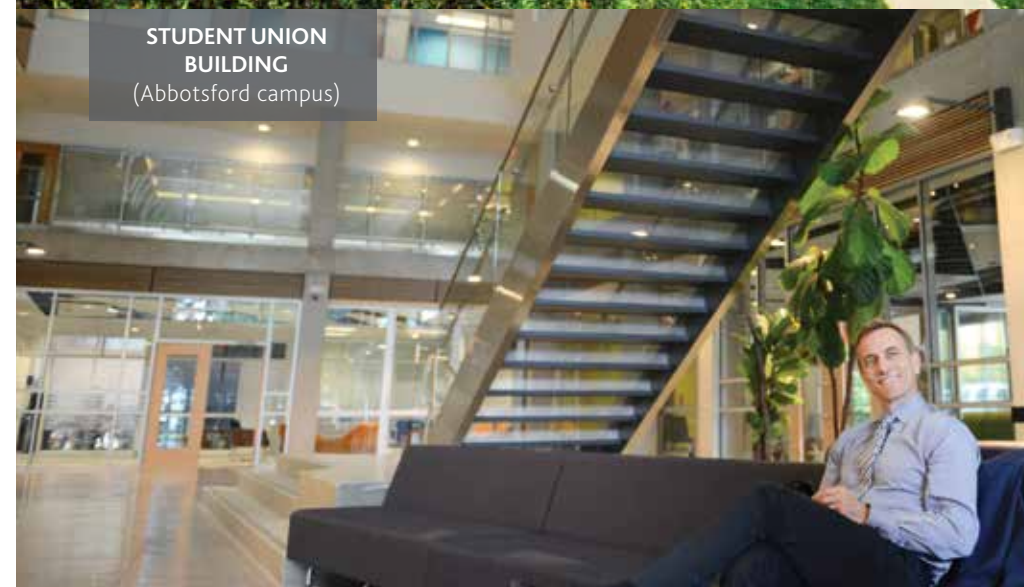
STUDENT UNION BUILDING (Abbotsford campus)