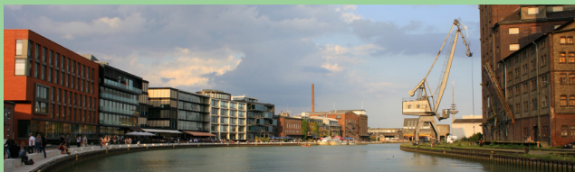
The Port in Muenster