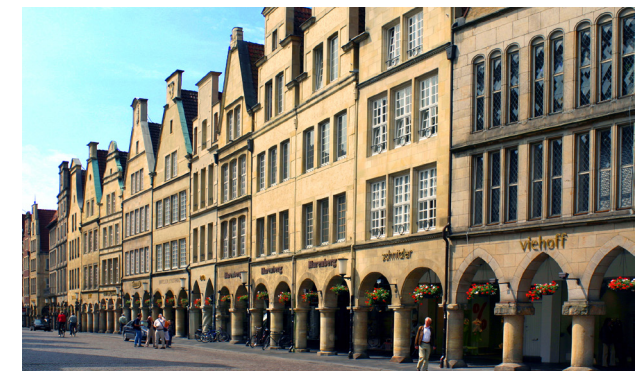
Münster, Prinzipalmarkt

Potential non-academic fields of employment include the media, publishing, advertising, public relations, museums, festival organisation, consulting, national and international organisations dealing with migration, language policy, or international cultural relations, as well as multinational businesses in various sectors.