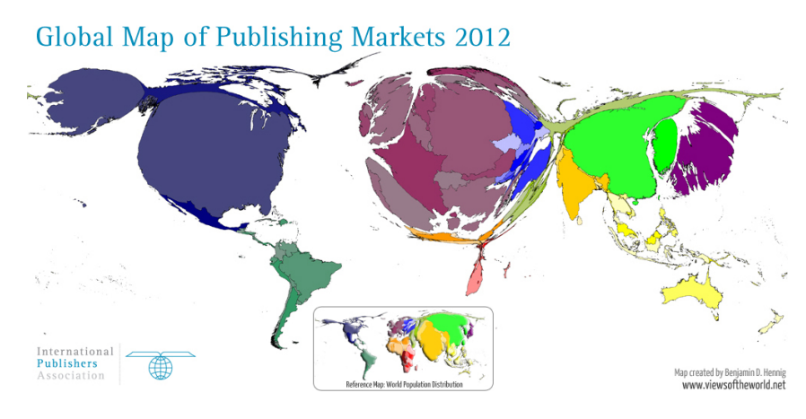
© B. D. Henning, Views of the World, 2012