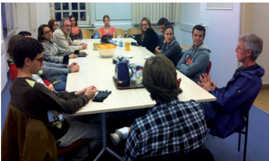
Figure 7. Meeting of the Brazil Centre with CsF-awardees