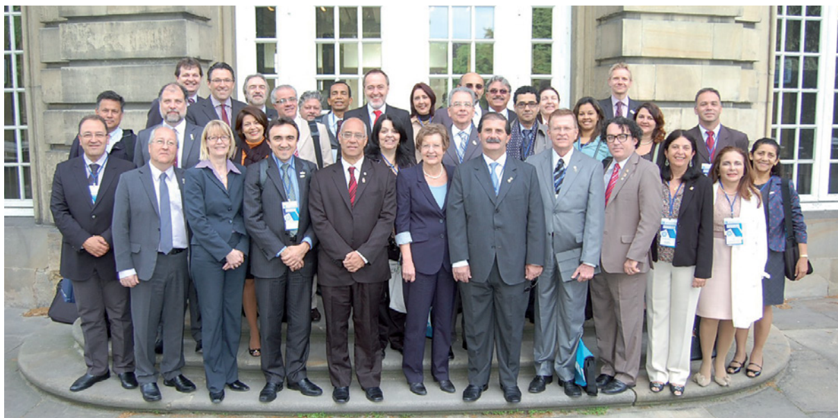
Figure 5. ABRUEM delegation visiting the University of Münster.

Since the launch of the program Science without Borders, the Brazil Centre has been engaged in its application and, together with the International Office, coordinates its administration at the university. With the implementation of a central tutorial board, the Brazil Centre offers crucial assistance to the Brazilian grant holders, a guaranty for a successful and profitable stay in Münster.