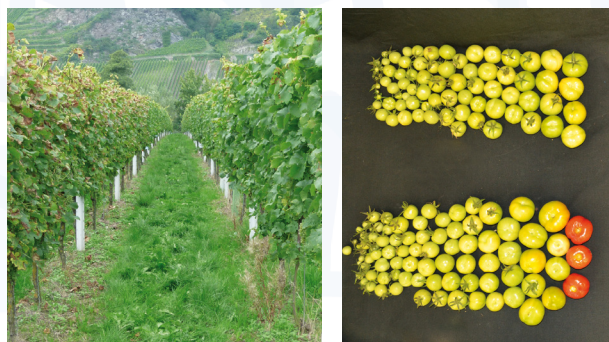
ChitosanS have strong resistance inducing and growth promoting activities in many crop plants. (Dr. Nannen, Dr. Moerschbacher)

Chitosan has been a 'promising' biomaterial for fifty years due to the superior material properties and the diverse biological activities reported, but chitosan-based products were slow to enter the market due to poor reproducibility in production processes and product performances. This picture is changing now as we understand chitosan to be a family of biomolecules differing in structures and functions, and as research of the past decades has elucidated detailed molecular structure-function relationships of these many chitosans.