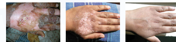
ChitosanS can keep wounds clean and can promote scar-free wound healing even in case of severe burns. (Dr. Gillet)

The conference will be preceded by a Young Researchers Symposium reserved for doctoral and early post-doctoral researchers, and followed by a Technical Workshop on analytical tools for structural and functional analyses of chitin and chitosans. We will reserve plenty of time for interactive poster sessions, organize an Exhibition of ongoing large chitosan-related projects, chitosan-based products, and chitosan-relevant technologies, and offer match-making opportunities to meet with other participants of your choice, in particular to facilitate discussions between young and experienced researchers, as well as between scientists from academia and industry.