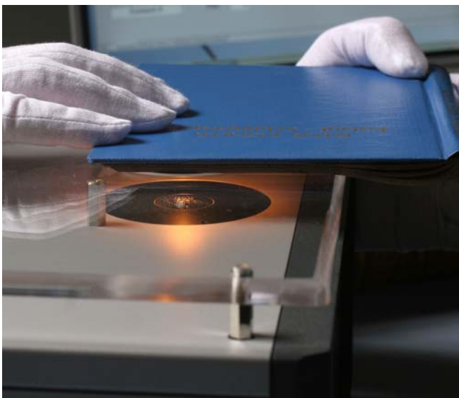
FIGURE 2 The SurveNIR instrument prototype. The table made of Perspex is positioned at a fixed distance from the measurement aperture, so that there is no direct contact between an item and the measurement opening

The prototype was purpose-built for conducting surveys of large paper-based collections as it allows rapid object handling and data acquisition. During such surveys, the condition of a whole collection can be assessed in order to plan for large-scale preservation and conservation actions. Traditionally, surveys are performed using subjective tests, such as the manual folding test, however, it is well known that subjectivity seriously influences the results of such surveys [18]. The instrumental approach is expected to both accelerate the surveying procedures and increase their reliability.